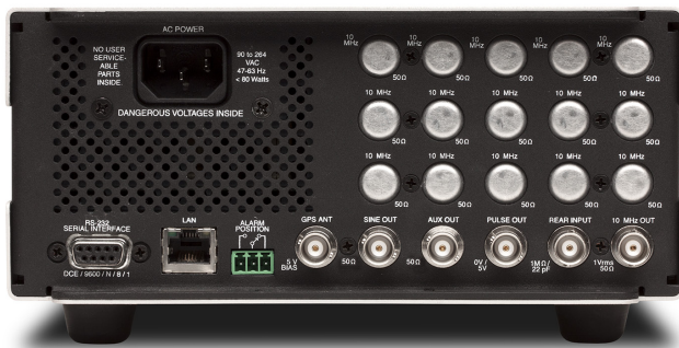
FS740 rear panel

Optional distribution amplifiers, each providing six additional rear-panel outputs for the 10 MHz, SINE, PULSE, AUX or IRIG-B outputs, can be installed. Up to three distribution amplifiers can be installed and configured from the front panel. Each output has its own driver which provides high isolation between outputs.